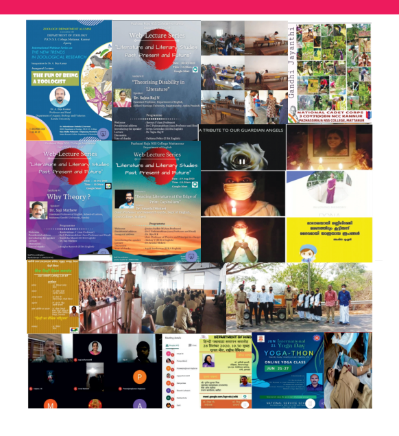
PAZHASSI RAJA NSS COLLEGE, MATTANNUR